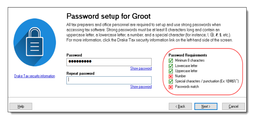
Figure 1-1: Password Setup window

"strong" password, meeting the requirements in the Password Requirements section of the window (red circle in Figure 1-1).