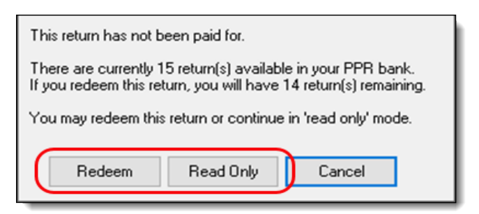
Figure 1-2: Pay Per Return alert prior to redeeming a return

Before a new PPR is redeemed, a Pay Per Return alert appears on your screen, informing you that proceeding will reduce your bank of purchased (but unredeemed) PPRs by one (Figure 1-2).